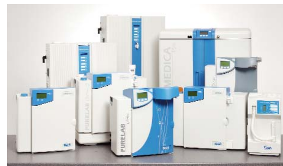
Figure 1. The PURELAB range

Meeting this specification from mains water means that the PURELAB Option-Q has to cram a lot of technology into a small, bench-top cabinet (Figure 1), as the flow diagram (Figure 2) shows.