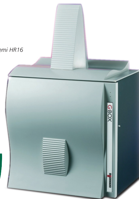
G Box :Chemi HR16