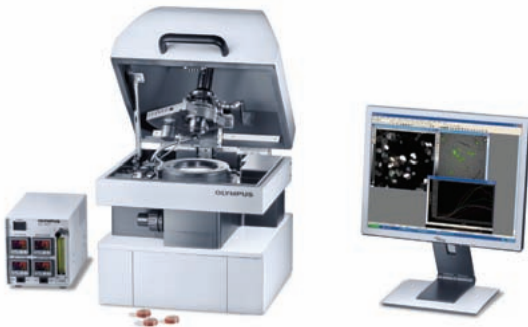
Figure 2. The Olympus LV200 Luminoview.