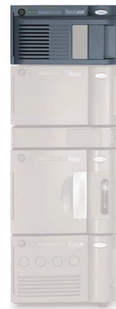
The ACQUITY QDa® Detector with the ACQUITY UPLC® I-Class System