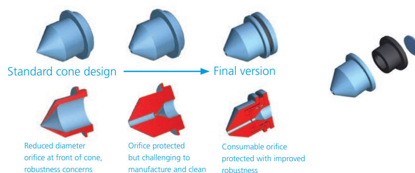
Evolution of reverse cone geometry