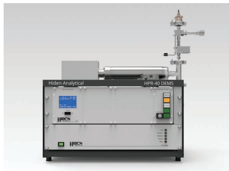
Hidden's HPR-40 DEMS

Hidden Analytical's proprietary differential electrochemical mass spectrometer system is the HPR-40 DEMS: a compact bench-top system with a standard mass range of 200 amu. It is highly user-configurable, with a range of electrochemical half-cells that house integrated membrane inlets to the mass spectrometer unit. The analyser itself is the established HPR-40 dissolved species analyser (DSA), which boasts sub parts per billion (ppb) detection levels and rapid response mass scanning of multiple species in situ.