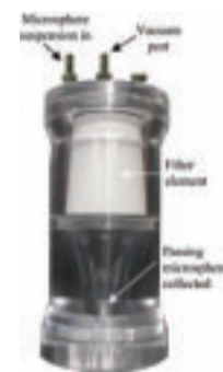
A Whitehouse Scientific Challenge Test Apparatus for Air Filters

The Aerosol challenge test methods as they are known, are an extension of a much more traditional form of challenge testing where particles are presented to a filter either as a dilute suspension or as a dust cloud and the effect on particle size distribution studied.