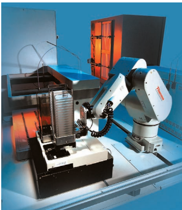
A vast range of Lab Automation will be on show

Attracting over 2000 attendees last year, from bench scientists to laboratory managers, the show has gone from strength to strength and this year will be bigger than ever. IBLA will accommodate over 120 of the leading suppliers in the life science industry, all exhibiting their latest products and services. Furthermore, with over 75% of last year's exhibitors rebooking for 2005, the show's ever-increasing popularity is very apparent. Described as 'the only event for all those interested in analytical equipment for life sciences', IBLA accommodates an extensive range of companies, providing the visitor with an in depth view on the established majors, alongside the latest hot new biotech equipment companies. From antibody and cell culture technology to bioinformatics and analytical instrumentation, IBLA has it all.