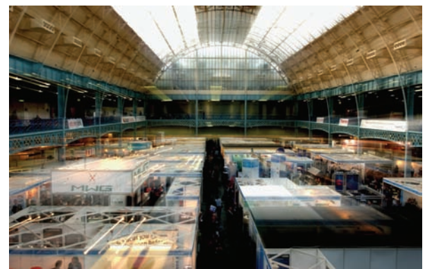
The IBLA main exhibition hall, Olympia, London, UK

In addition to the two innovation-packed exhibitions of biotechnology and lab automation products, there will also be numerous workshops, seminars, poster sessions and many other educational and networking opportunities, including the affiliated Lab Automation Europe conference.