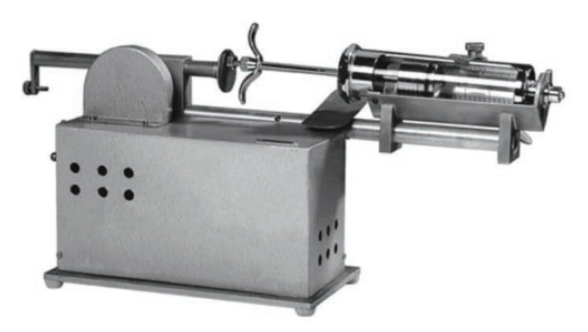
Figure 1. A simple infusion device designed by Dr Hess possessing primitive gearing

Although modern syringe pumps may have differing designs depending on their area of application, they all nevertheless contain the same basic components: the syringe holder, the threaded spindle that drives the syringe plunger, and a control program. In most cases, the spindle drive makes it possible to transport a continuous volume at a tolerance that is often given as + 2%. The fluid volume that is actually transported depends on the predefined drive speed as well as on the volume of the syringe. The decisive factor is therefore the distance the syringe plunger has to travel in a given time in order to achieve the desired fluid flow with the employed syringe volume. Absolute volume control is achieved through the principle of direct displacement. It is not necessary to calibrate the pump because the precision of the flow speed is always equally high.