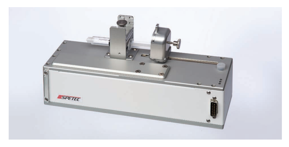
Figure 3. The SYMAX syringe pump

The SYMAX syringe pump was designed to meter different fluids in the microliter and nanolitre range. The mechanical highlights are the gearless stepper motor for the carriage drive, the high-precision carriage itself, the adjustable syringe holder (see Figure 2 ) and the resulting possibility of replacing syringes. The extremely high resolution of 25,600 individual steps per revolution makes each step imperceptible while simultaneously guaranteeing the transportation of exactly 4 pL per pulse when using a standard syringe. Depending on the volume of the employed syringe, the total amount delivered is between 0.5 nL and 44 mL per minute. Both disposable and metal-free precision syringes can