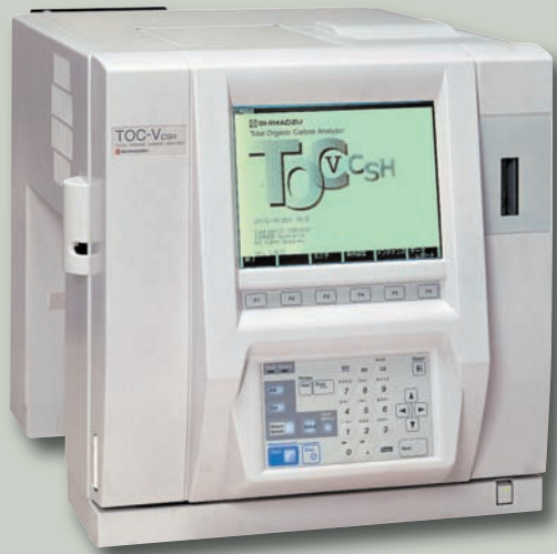
Figure 2: Shimadzu TOC-VCSH

“The TOC-V combustion analyser can directly analyse samples containing large concentrations of inorganic salts accurately and without dilution or other pre-treatment procedures”