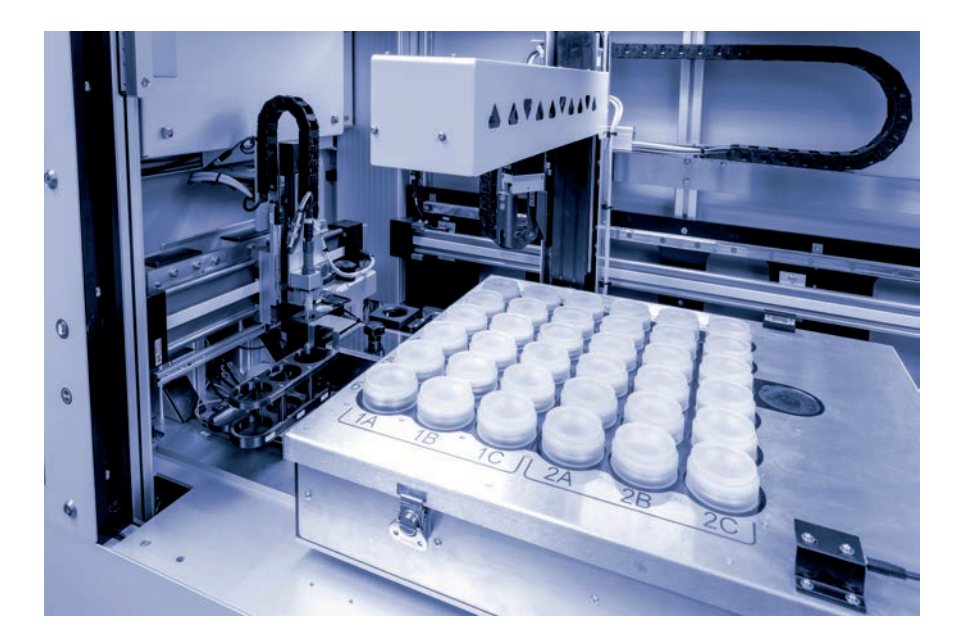
Figure 3: Tempered rack in the HTR 3000.

A tempered storage rack for 36 cups, shown Figure 3 , keeps samples at a temperature range between +4^{\circ} C and +45^{\circ} C, so items like dairy products don't go bad during storage.