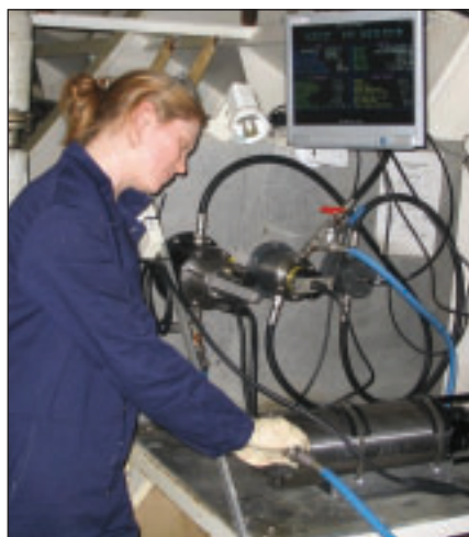
Figure 2. The FerryBox flow through system - the instruments for measuring temperature conductivity, fluorescence and oxygen in their flow housing, and Fast Repetition rate fluorimeter under test on the bench in the foreground.

requirements of P&O Ferries Ltd (2) to be reliable electronically and mechanically (3) to provide data of oceanographic quality (4) to log data at 1Hz to detect small oceanographic features (5) to automatically send data ashore so that the functioning of the system could be monitored and failures detected ahead of service visits. In addition, environmental requirements dictated that the system should run reliably within any of the ships engine spaces (summer temperatures above 40 °C and 100% humidity), with no risk to disruption of the primary activity of the vessel. Also maintenance must not interfere with the ship's functions, and be able to be done by a non-expert within a maximum of 2 hours when the ship is in port.