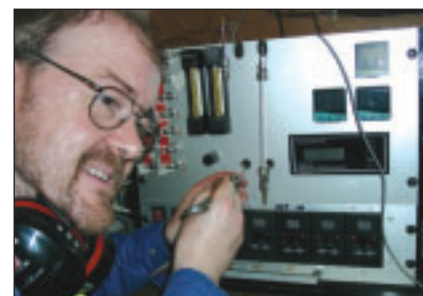
Figure 4. The autonomous membrane-inlet purge and trap system being fitted in the Pride of Bilbao engine room.