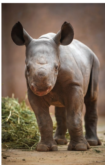
Figure 3. One of the products of the testing of the female black rhinos at Chester Zoo

The ability to monitor non-invasively hormone levels in animals can be a useful tool for researchers, conservationists and animal managers alike to help understand reproduction and adrenal activity, and investigate a wide range of hormone-behaviour interactions [3,7,1]. This approach has been applied to several different species and the pioneering work performed at Chester Zoo is being carefully monitored by many other conservationist groups located around to world. The outcome of this study was a practical method by which faecal samples can be extracted under field conditions, without the need for extensive equipment or electricity, and loaded onto C8 HyperSep™ SPE cartridges. These cartridges can then be stored at ambient temperatures for up to 6 months prior to re-extraction and enzyme immunoassay, without degradation of hormone metabolites. SPE cartridges are compact and lightweight and can be easily transported back to the laboratory following faecal extraction eliminating the need for approaches that require electricity or have safety issues.