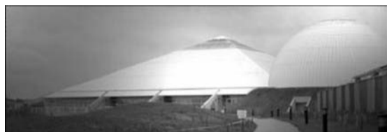
Intech Science Centre, Winchester

Automation and computer control of analytical instrumentation increasingly results in the generation of copious amounts of valuable data.