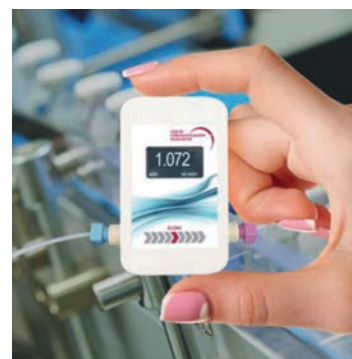
Figure 2: Compact non invasive flowmeter

These flowmeters operate on the basis of a thermal determination of effective flow. They offer high precision and accuracy, combined with excellent resolution. Of significant importance, when troubleshooting, they also offer a fast response allowing Service Engineers to detect very short-time