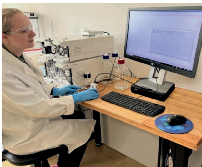
Figure 1: A new field service tool for HPLC / uHPLC

Precise monitoring, maintenance and troubleshooting play a vital role in ensuring the accuracy and repeatability of data from HPLC/uHPLC systems. Operating for extended periods of time and expected to deliver a stream of solvents not only at a constant rate, but at an exact rate selected by the user, solvent delivery pumps are core to any HPLC/uHPLC system.