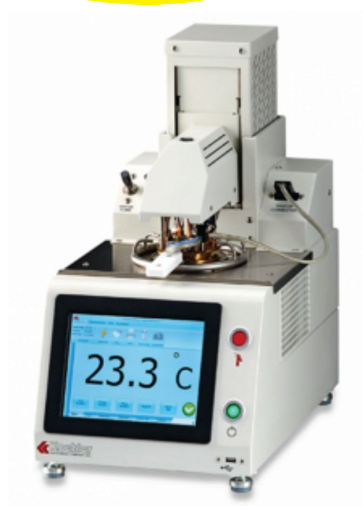
Figure 2. The latest automatic Pensky-Martens Closed Cup Tester (Koehler Instrument Company).

A note should also be made about the question of whether results from one method can be directly compared or correlated with results from another method, or if methods can just be substituted between each other. Due to the fact that the various apparatus designs and procedures in each method are very specific and they are each unique, it is not recommended that two different methods be compared directly. Most of the methods under the jurisdiction of ASTM Committee D02 begin with the following message which addresses the issue: