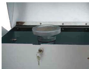
Cabinet's lock details

The flow measure and regulation in relation to actual condition, make ECHO HiVol a unique instrument.