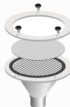
Filter holder for TSP collection detail