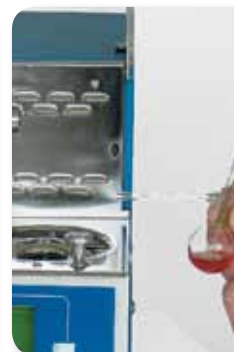
Inject Next Sample